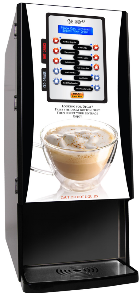
Bistro 10-T3 H&C