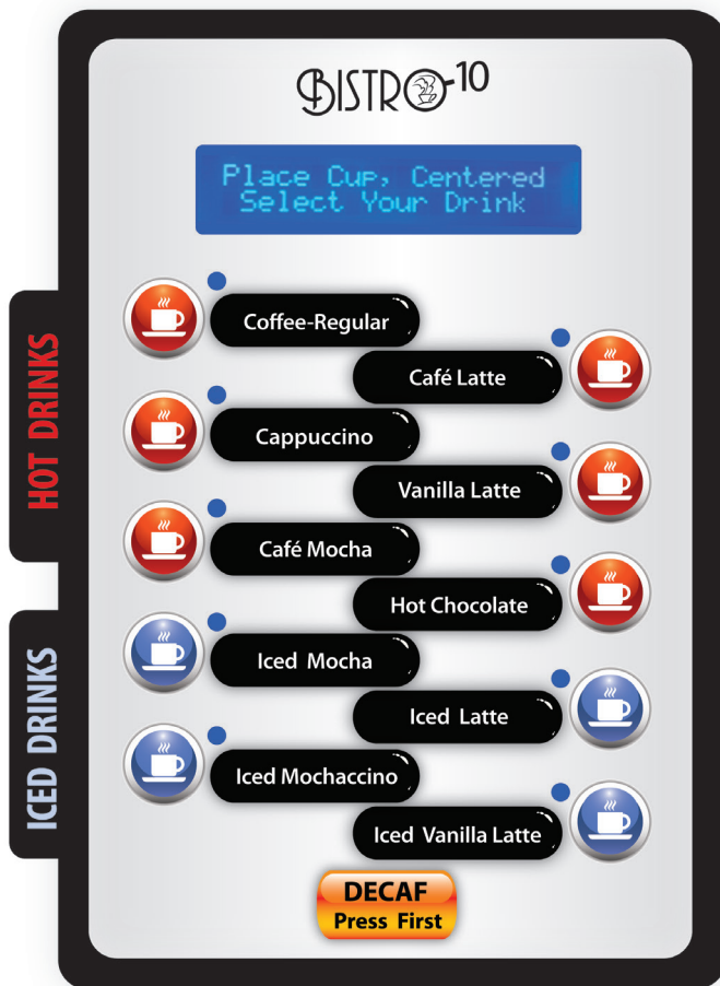
Close-up of membrane switch showing our standard drink options for the Hot and Cold model.

Bistro 10-T3 H&C's entire front can be custom branded with your image helping you to promote your brand and services.